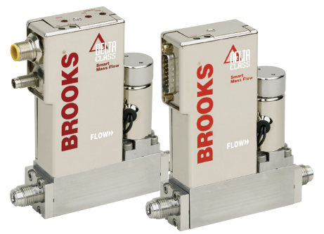
SLA7840 Remote Transducer Pressure/Flow Controllers