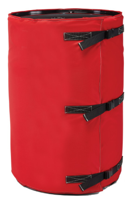
Insulator — Pairs nicely with BriskHeat® silicone rubber drum heaters