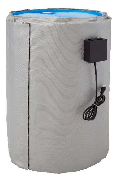
Single-Zone Model — Good general-purpose choice