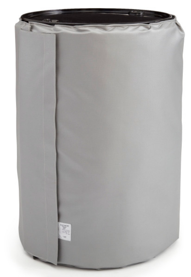
Insulator Only Model - Pairs nicely with BriskHeat® silicone rubber or immersion drum heaters