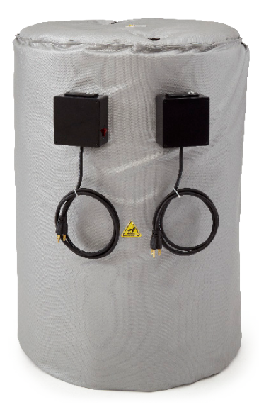
Dual-Zone Model - Quickly melt viscous materials like molasses, syrups, etc.